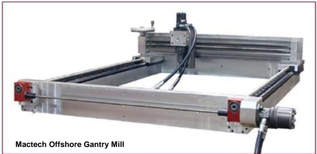
Mactech Offshore Gantry Mill

Mactech Offshore presents the newly-designed Gantry Mill . This powerful mill can easily cut large openings in submerged decks, crew quarters or any structure for rigging or access holes. Fast set-up and fewer adjustments for each operation mean the Gantry Mill will save you time and money. True 3-axis movement can cut almost any shape or pattern desired. The modular design can be custom designed and configured for a variety of sizes and configurations. Variable speed feed control allows full control of speed and direction of your milling operations.