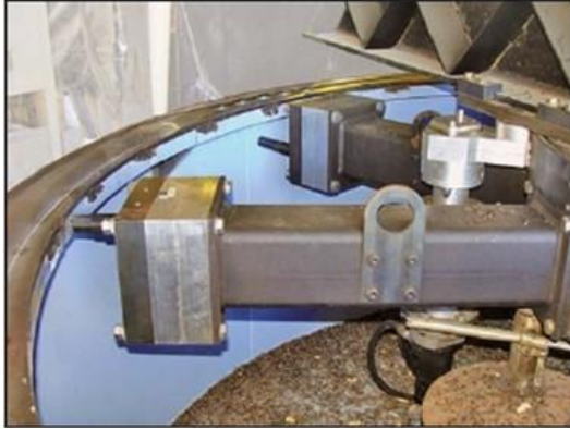
Adjustable Mounting Legs

On-Site Facing and Milling Large Diameters