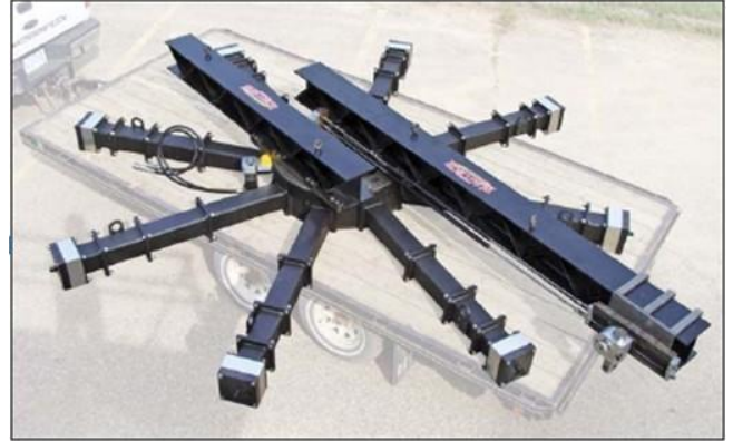
DFM 5000 Large Diameter Facing Machine

The Mactech LDFM 5000 Facing Machine is designed for on-site precision grinding, single point, mitering and rotary milling capabilities on large diameter flanges. Adjustable mounting legs secure the machine to the inside diameter of the workpiece. Features include mechanical feed from multiple ramps and variable speed in radial and axial planes. Optional tool holders, milling heads and motors are available.