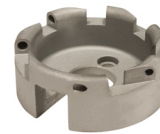
Membrane and Overlay Heads look similar. Overlay Heads have a slightly smaller circumference.