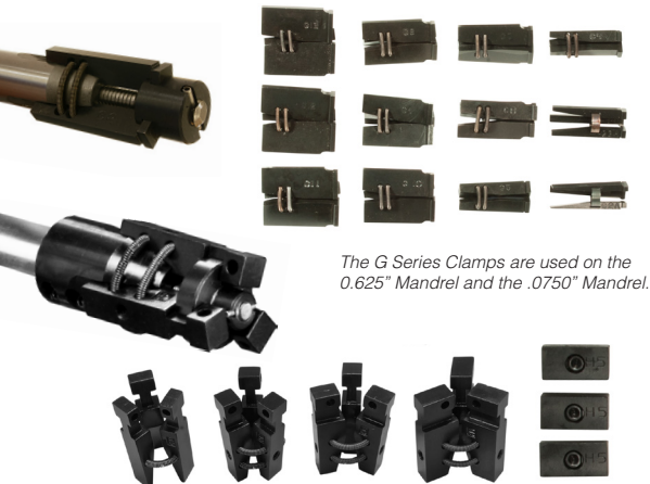
The G Series Clamps are used on the 0.625" Mandrel and the .0750" Mandrel.