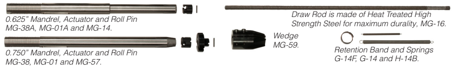
0.625" Mandrel, Actuator and Roll Pin MG-38A, MG-01A and MG-14.