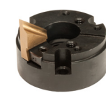
Base Head with O.D. bevel Cutter Blade.