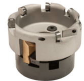
Membrane and Overlay Heads attach to the Base Head.