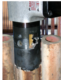
Standard membrane/overlay heads cut to a depth of 0.75" before the bevel blade begins to prep the tube. Pictured is a custom head that removes 4.0".