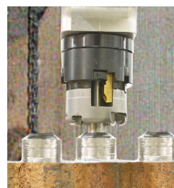
Boiler tube membrane overlay removal and bevel.