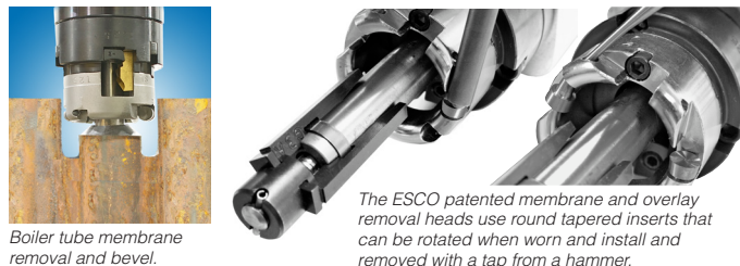
Boiler tube membrane removal and bevel.