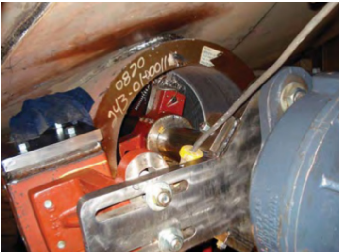
On-site rudder tube machining with MBMC4 Boring System positioned vertically

The MBMC4 Portable Boring System is a proven, reliable and affordable solution to your on-site machining needs