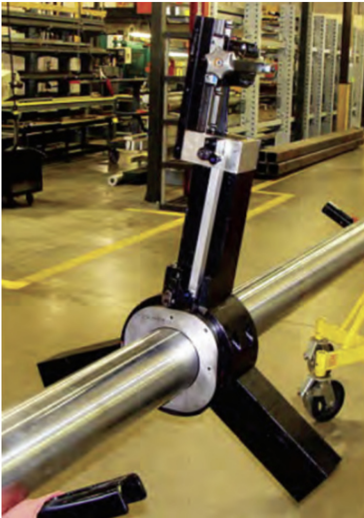
MBMC with Facing Arm Attachment

The MBMC 6 Facing Arm Attachment is well-balanced for top performance and is easy and fast to install